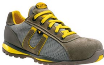
75029 - MOON ROCK