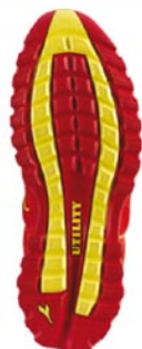
FLARED TO PROVIDE HIGHER COMFORT AND STABILITY